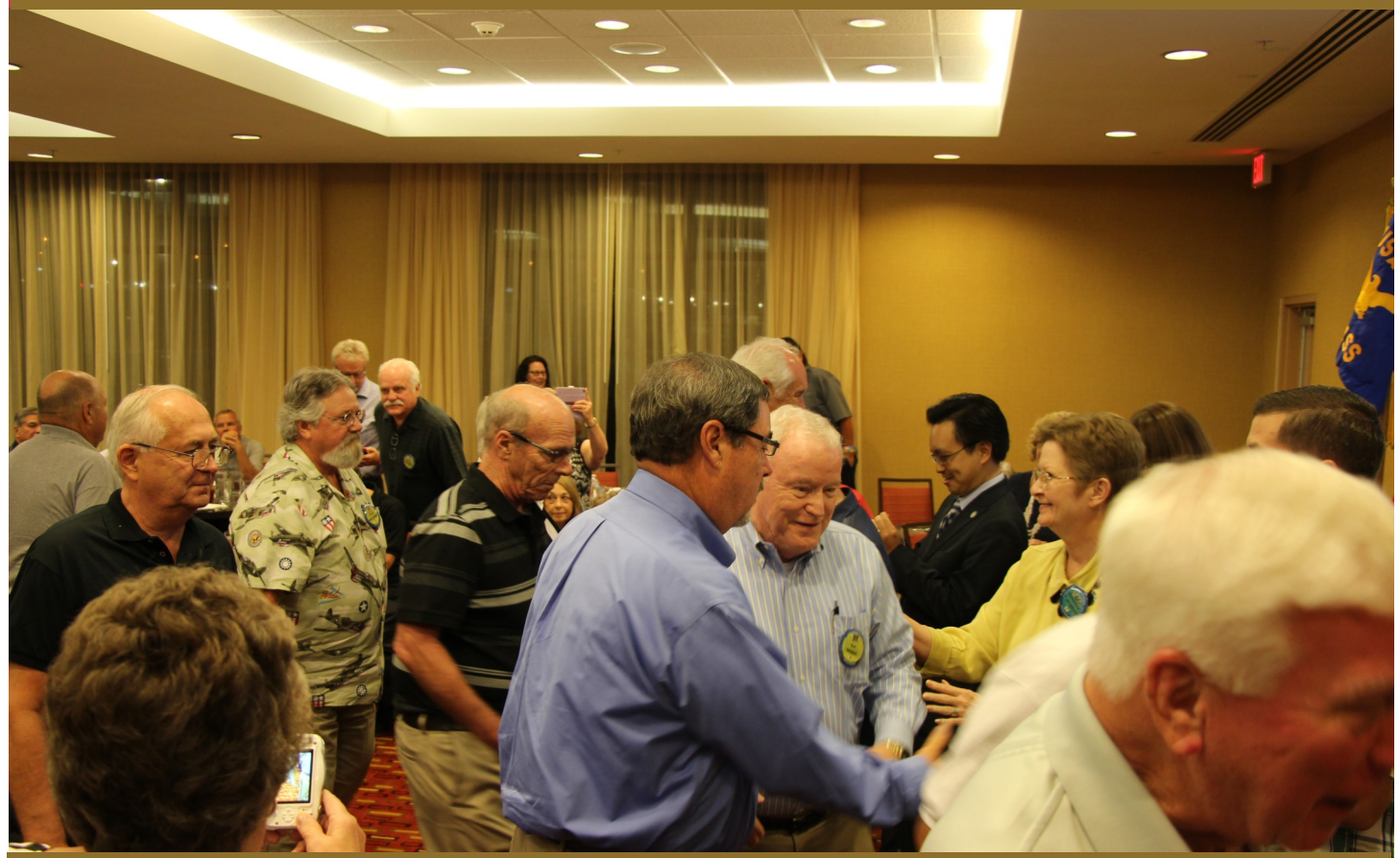
September 23, 2016: 6994th Security Squadron Vietnam War veterans come forward to be presented the commemorative lapel pin by members of the EC-47 History Site CPP committee members during the unit's reunion dinner ceremony.