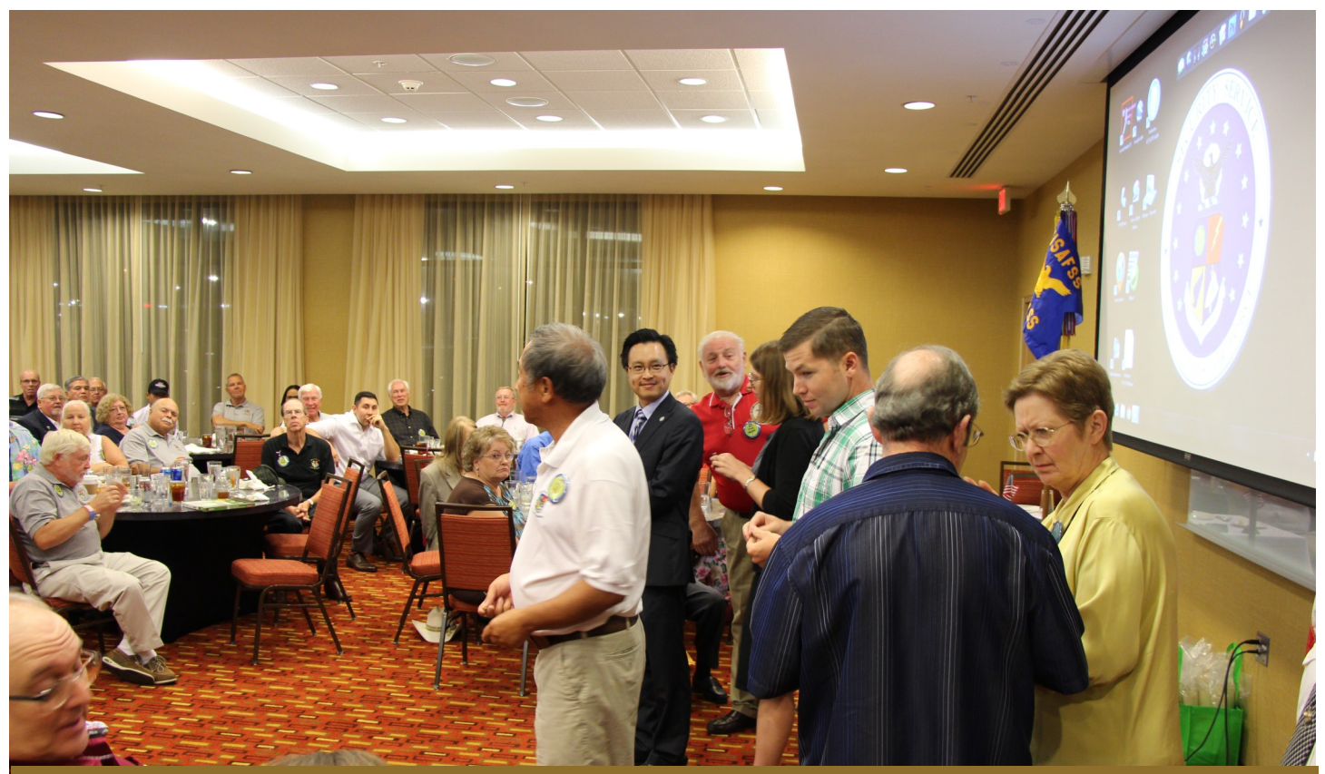
The EC-47 History Site CPP committee, represented by the 6994th Security Squadron, the 94th Intelligence Squadron, Angelo State University Department of History and the West Texas Collections, and the Heritage Chapter - Freedom Through Vigilance Association, prepare for the pinning ceremony at the 6994th Security Squadron 50th Anniversary reunion dinner.