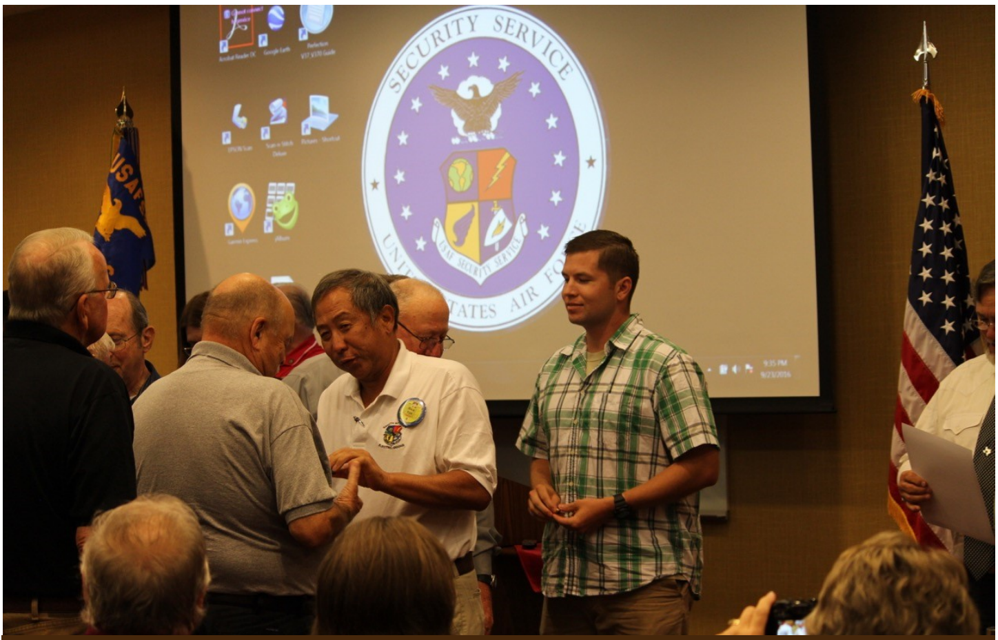
September 23, 2016: Vietnam War veterans are called forward and presented commemorative lapel pins by the EC-47 History Site CPP committee members. More than 70 veterans and their families were recognized and welcomed home at this special ceremony during the 6994th Security Squadron's 50th Anniversary reunion dinner party held in San Angelo, TX.